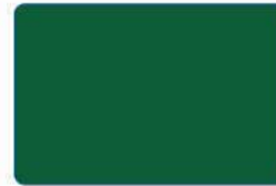
H411 Dark Green