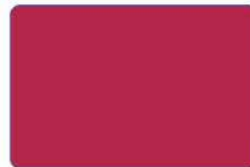
H301 Donna Red